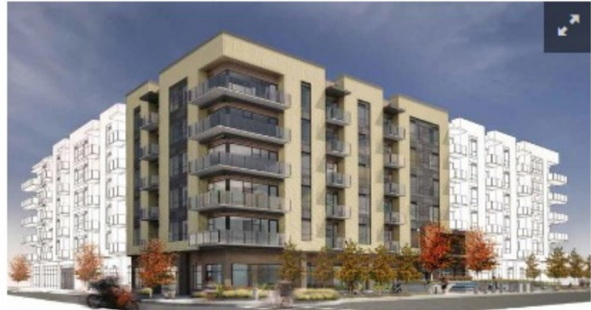
Construction financing has been arranged for the Uptown Apartments, a 167-unit project... more

Thanks to a $29.5 million construction loan arranged by CBRE Capital Markets' Debt & Structured Finance team, Cascadia Development Partners and HomeStreet Bank, the Uptown Apartments are on their way in downtown Vancouver. The 167-unit, mixed-use building will rise from a full city block along Main Street.